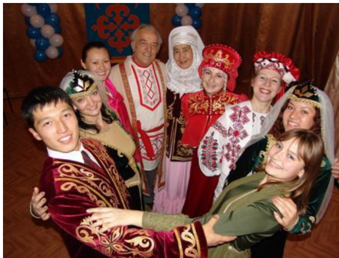
Photo 2. Nations and Ethnic Minorities in Kazakhstan