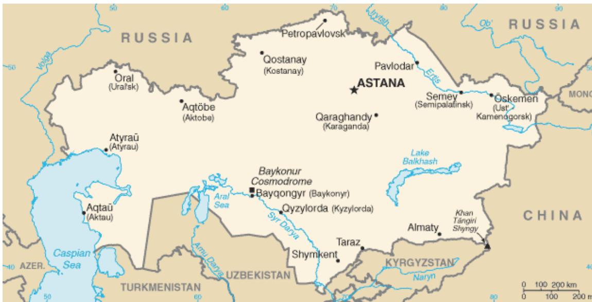
Photo 1. The Map of Kazakhstan

Therefore, the Republic of Kazakhstan has become home to more than one hundred ethnic groups, among which the biggest are Kazakhs 63,1 %, the Russians - 23,7 %, the Uzbeks - 2,9 %, the Ukrainians - 2,1 %, the Uigurs - 1,4 %, the Tatars - 1,3 %, the Germans - 1,1 %, and other ethnic groups - 4,5 %. 1