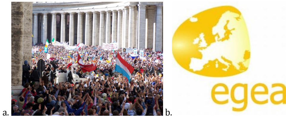
Figure 4. a.mass tourism at Vatican; b. Egea's logo

promote own languages, as Syria, where tourists go to learn Aramaic. In countries as Portugal and Pakistan the intercultural exchanges are encouraged in order to develop understanding each other, promoting the friendship relations between countries. In New Zealand, youth tourism is defined as that form of tourism that is practiced by the youths that visit a country with educational purpose, and who stay there less than a year. We can say that the main characteristics of the youth tourism are that it is practiced by people between 15-26 years old, it is a niche industry, it has an educative purpose, and it represents an international instrument of exchange, peace and tolerance. An example of youth association regarding traveling is EGEA (European Geography Association), that has a logo (Figure 4b), a website and a great community of young geographers.