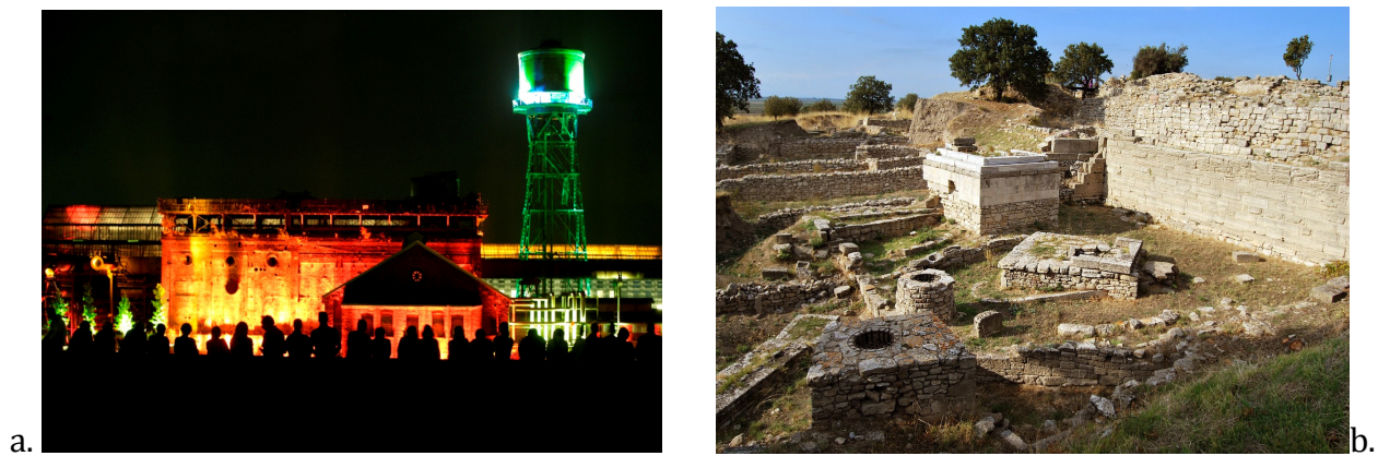
Figure 2. a.industrial tourism; b. site of Truva, Turkey

Another perspective on tourism as a resource is the scientific one- tourism as a scientific resource. Touristic interpretation [7], as a tool in managing touristic space and resources plays an important role. Through it, historic and archeological sites are evaluated, interpreted and arranged according with the touristic interpretation principles. The final goal of this actions is the reconstruction of a site- in the place of some stones, there is partially or integrally the objective. A good example is the archeological site of Truva in Turkey from Figure 2b (here are located the ruins of Homer's Troy). After rearranging the site according with the interpretation principles, the scientific resources became more complex due to the fact that they finally had a perspective on the site.