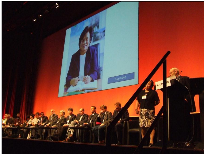
The First General Assembly of the IAG, 27 August 2013